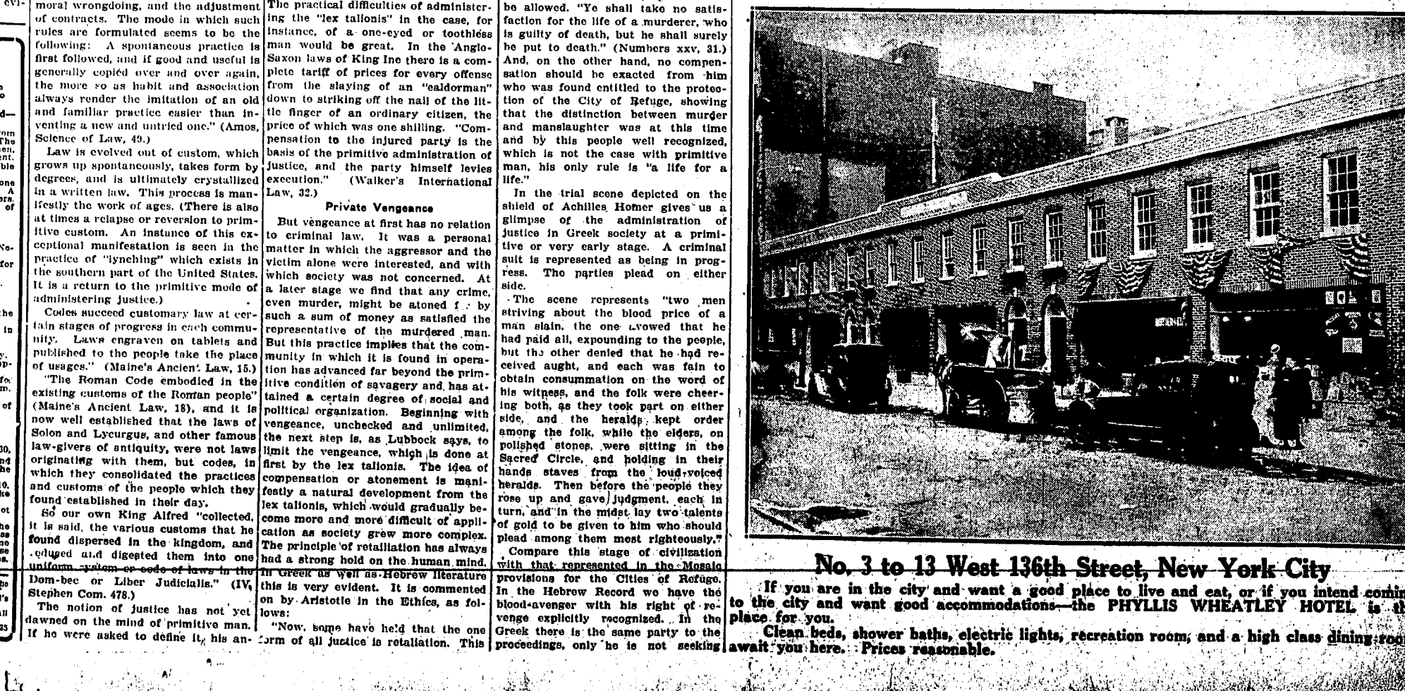
If you are in the city and want a good place to live and eat, or if you intend coming the city and want good accommodations—the PHYLLIS WHEATLEY HOTEL is the