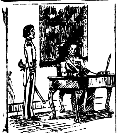
lsh consul in Antigua, a tall spare | tiful woman, having one-half Span- | Indies, on the 12th of November. strong man with coloring that char- ish blood and one-half Negro blood. 1875.